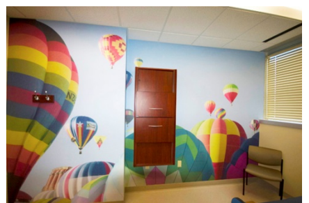
Wall Mural in Pediatric Exam room