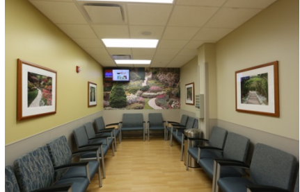
Wall Mural & Framed Art in Emergency Waiting Area