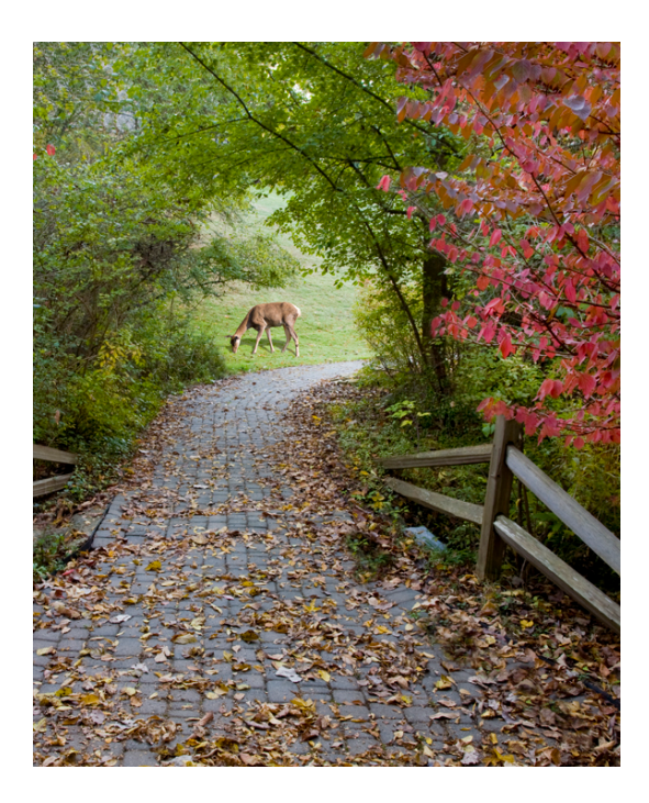
Other aspects of art should be taken into consideration for healing environments.