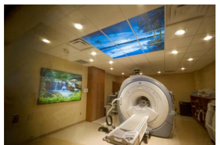
PhotoLight<sup>™</sup>Ceiling & Wall Panels in MRI room